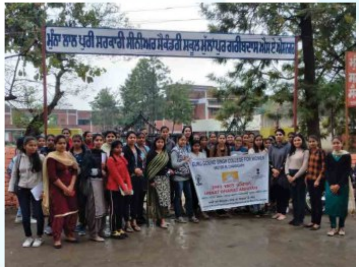
Unnat Bharat Abhiyan- A step towards better future

Admission of the candidate with a compartment, as indicated above, shall be provisional and will be confirmed only after he/she has cleared the compartment in two consecutive chances subsequent to his/her admission. In case the candidate does not clear the compartment at any of the two consecutive chances allowed to him/her subsequent to the date of his/her admission, his/her provisional admission to the course shall stand cancelled.