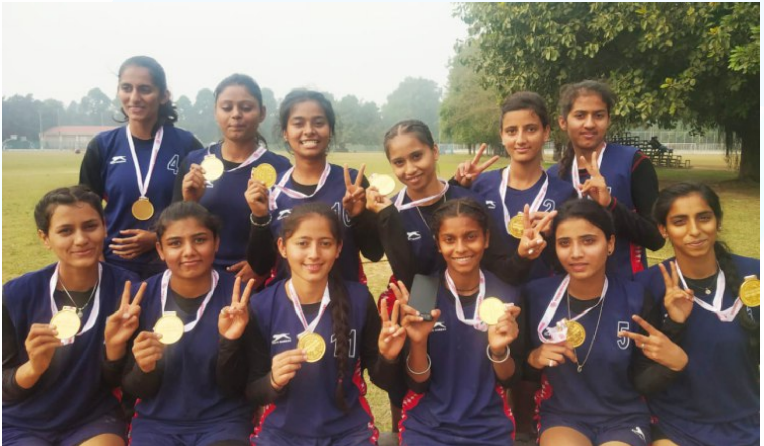
Golden Girls of The College