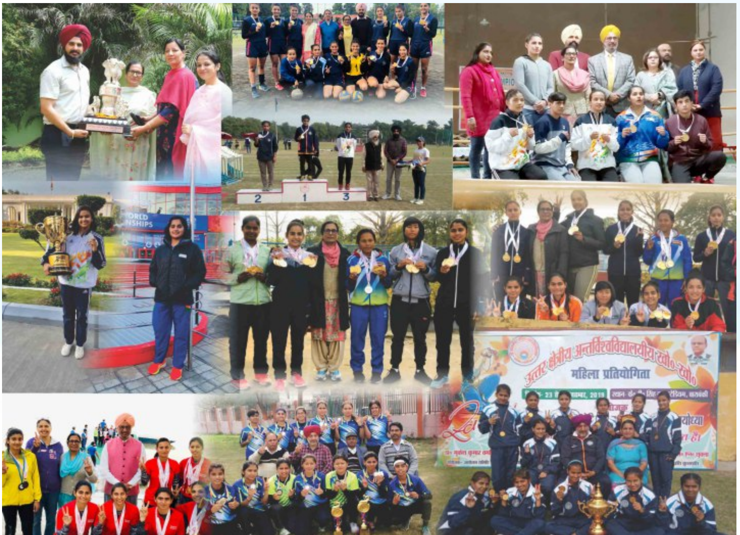
Teams of Guru Gobind Singh College for Women brought laurels to the Institution

Keeping the tradition of marvelous achievements, the College won Ten Sports Championships in the year 2019-20, by bagging First position in Panjab University Inter College Tournaments, namely in Volleyball, Basketball, Hockey, Cricket, Boxing, Swimming, Netball, Kho kho, Rowing, Kayaking and Canoeing. College Teams of Sepak-takraw Regu, Sepak takraw team, Wushu and Poomse stood Second during Panjab University Inter College tournaments. Teams of Taekwondo, Gatka, Gymnastics, Judo, Soft Tennis and Yachting bagged the Third position. Teams of Wrestling, Athletics, Weightlifting, Karate, Pencak-silat won Individual medals in Panjab University Inter College tournaments.